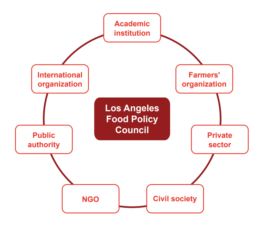
Figure 59. Types of organizations (constituencies) represented in LAFPC (in red)

Figures 59, 60 and 61 illustrate the representativeness and inclusiveness of LAFPC, showing the diversity of participating stakeholders in terms of types of organizations (constituencies), sectors and food systems activities represented.