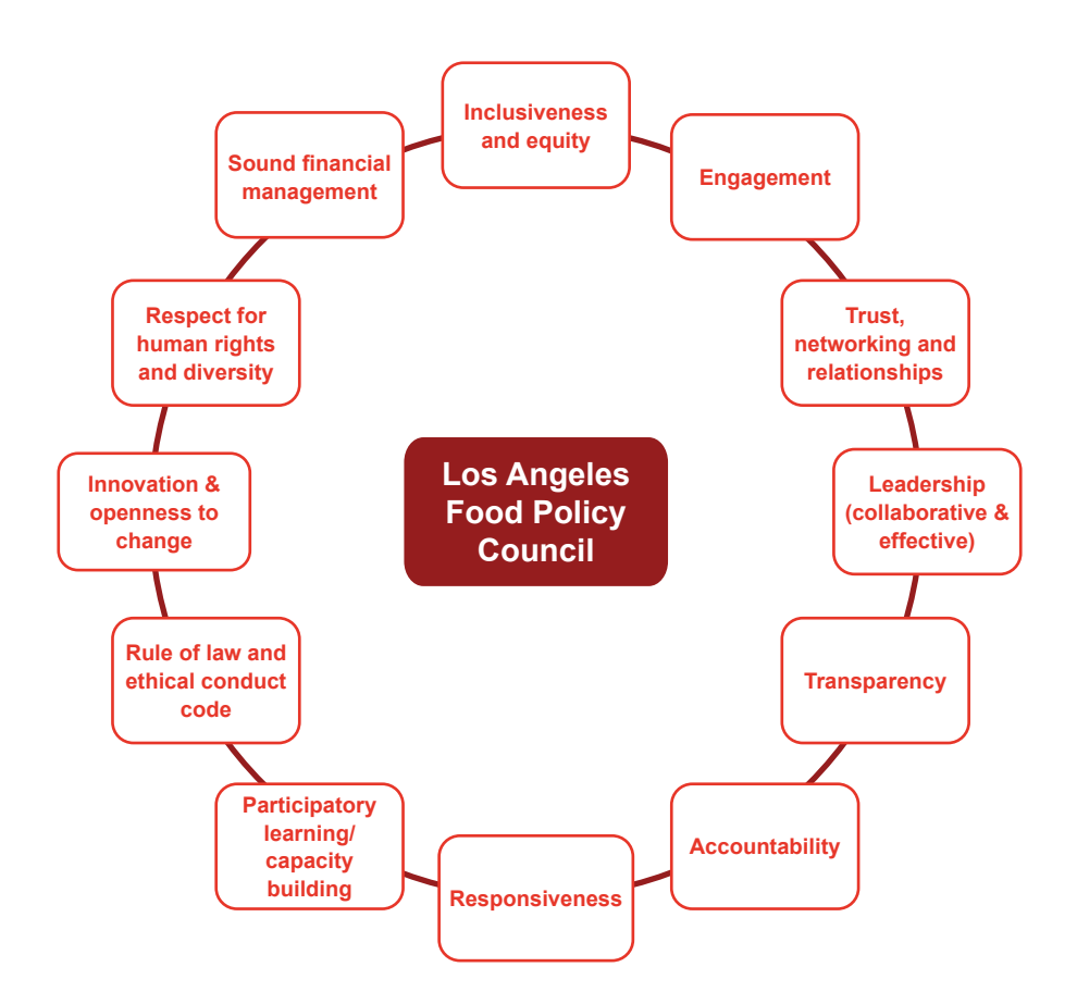
Figure 62. Good governance principles practised by LAFPC (in red)

In addition to these meetings, participants interact via emails, calls and other methods of communication.